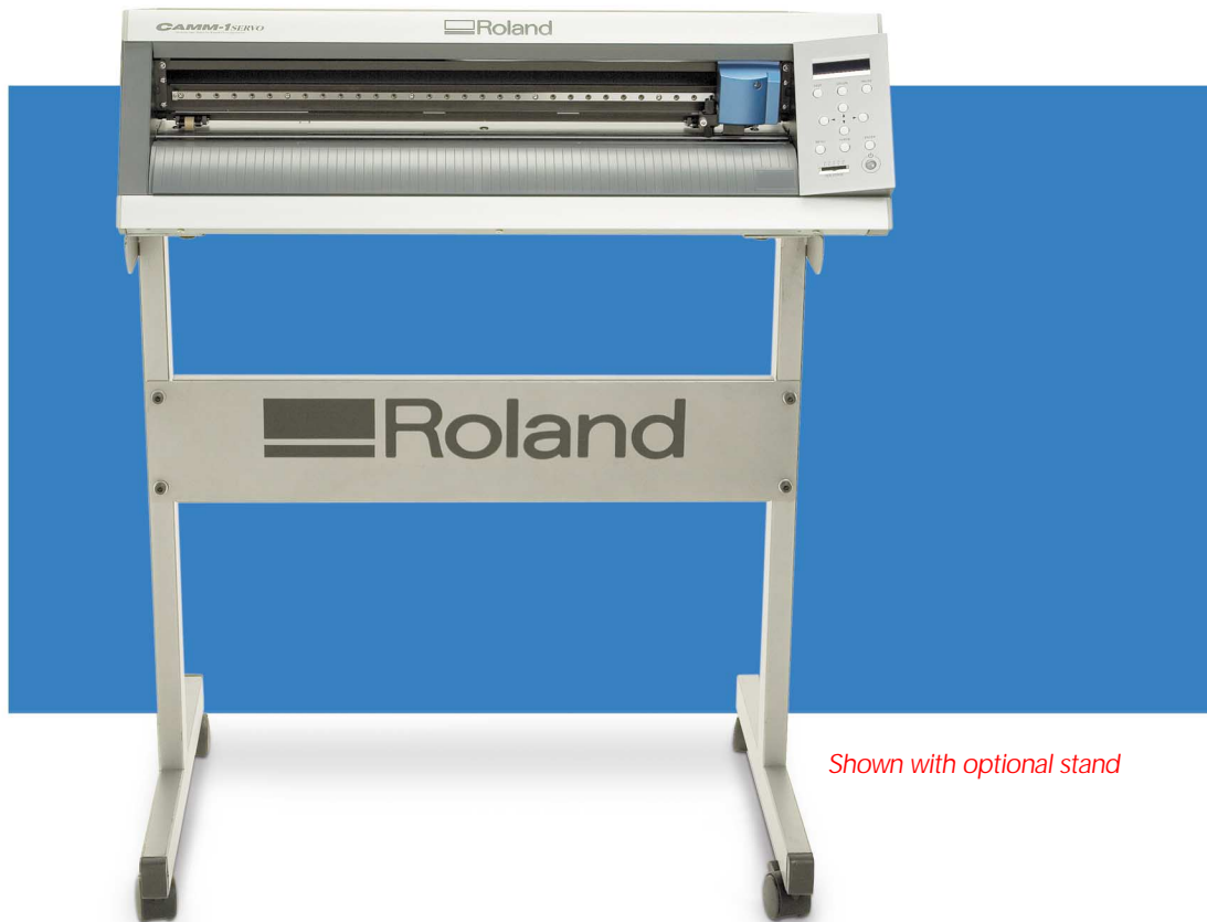
Shown with optional stand

Digital servomotor technology ensures the cutter's maximum accuracy and cutting speeds up to 20-inches per second. Easy access USB and serial ports make connectivity a snap.